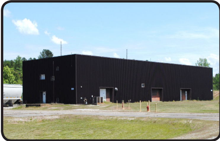
Remote Control Building. 11,200 SF/1,448 m2 remote control building. Rail adjacent to building. Computer control room, offices, and observation deck. Large base-ment.