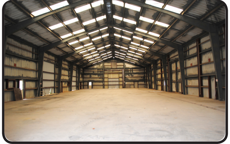
Building 1027. Building 1027 is 10,500 SF/975 m2 and is clear span with eave height of 20 feet/6 meters. Located in a cluster of similar buildings with a total square footage of approximately 45,000 SF/4,181 m2.