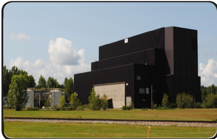
Turbine Building. The turbine building is 66,528 SF/6,181 m2, has a 250 ton crane, and an eave height up to 90 feet/27 m. The building has rail into the building.