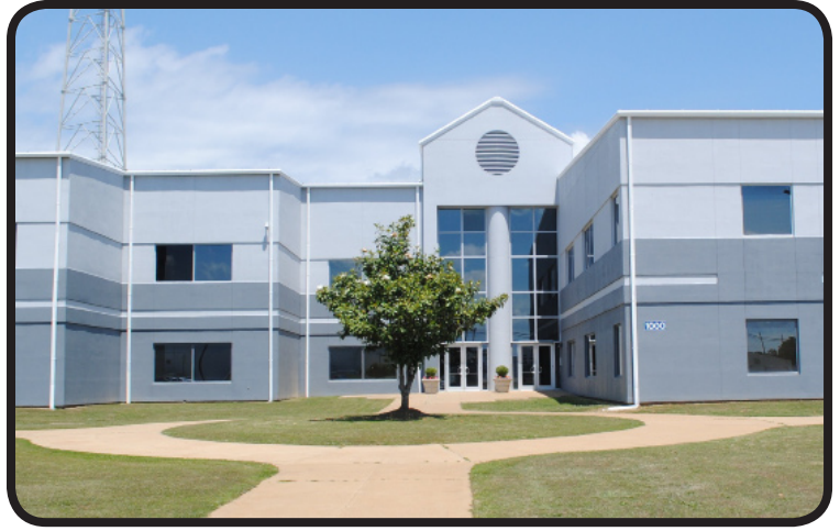
Office Complex. 169,000 SF/15,700 m2 office complex with approximately 100,000 SF available, fully furnished. 400 cubicles and 80 offices, conference center, break-rooms, computer room, community college, & cafeteria.