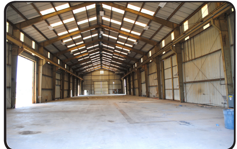
Building 1020. Building 1020 is 15,000 SF/1,394 m2, has a ten ton bridge crane, and is clear span with eave height of 20 feet/6meters. Two similar buildings are located adjacent to Building 1020.