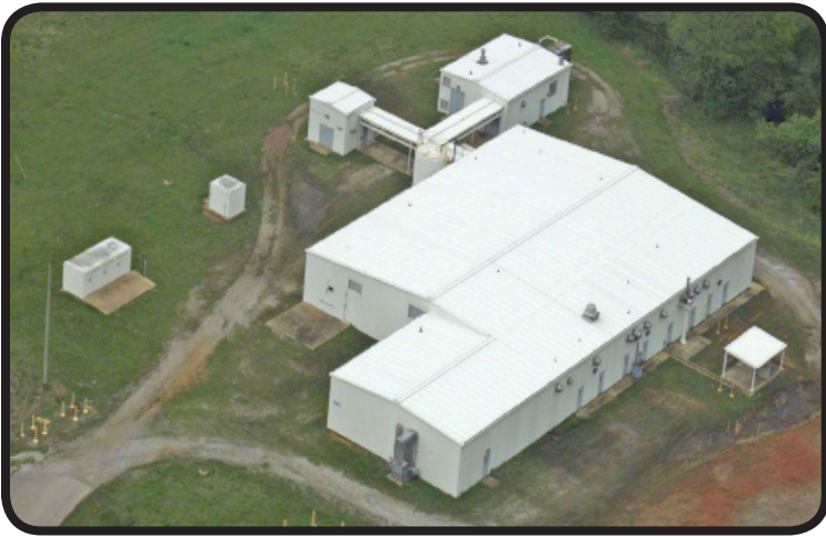
Laboratory. 16,100 SF/1,496 m2 in three buildings. Former NASA chemical laboratory, fully equipped with testing equipment. 10' ceiling clearance. Nitrogen and carbon dioxide gas systems.